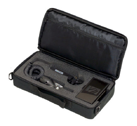
FBP-MTS-001 T-BERD/MTS Fiber Inspection Upgrade Kit