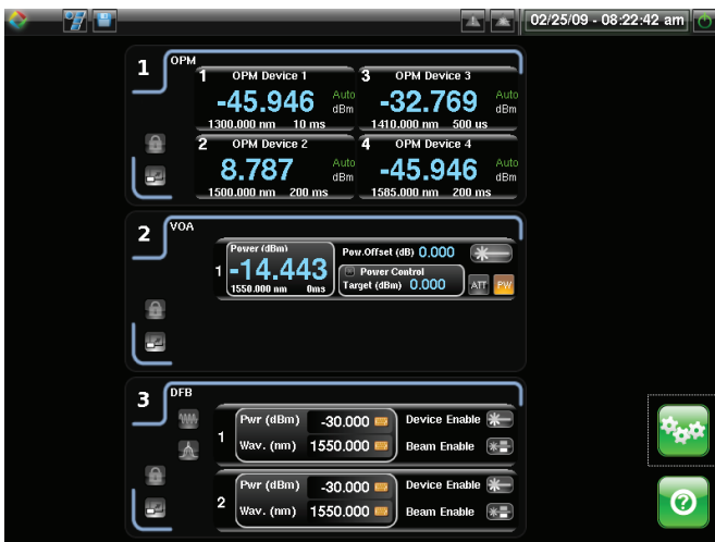
Figure 1. mOPM main user interface