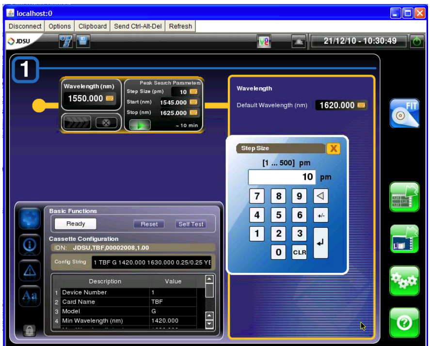
Figure 2. mTBF GUI - detailed view

The filter makes use of a diffraction grating to separate the input light along several discrete paths. A stepper-motor rotates the grating to transmit the desired wavelength along the output fiber.