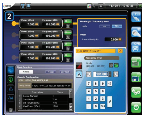
Example of an mTLG screen

The MTLG-C1 is a member of MAP-200 LightDirect basic fiber optic test tool family. LightDirect modules can be deployed in all available MAP chassis systems including the MAP-220C two-slot benchtop chassis. The MAP-220C is ideal for bench use or small test automation projects, and it features a local touch screen as well as Ethernet or GPIB automation. The second slot is ideal for an optical power meter or variable optical attenuators. The MAP-230B (three-slot) or MAP-280 (eight-slot) is ideal for large deployments and is the most compact optical test solution on the market.