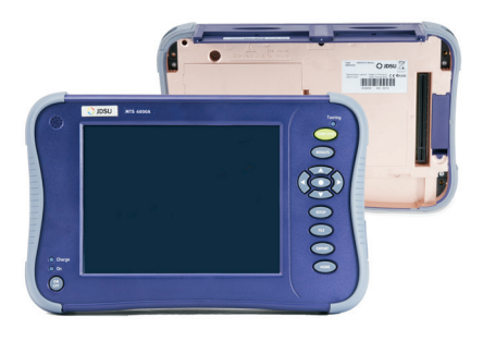
Back of the module carrier where other modules are attached

The multidimensional design of the T-BERD/MTS-6000A (V2) provides optimal configuration flexibility with extended battery life. The E6100 module carrier is best suited for fiber applications; whereas, the high-powered battery in the E6200 module carrier extends battery life when used with the carrier Ethernet (MSAM) or other intensive fiber applications.