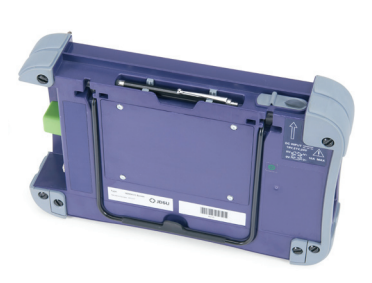
E6100 Fiber module carrier