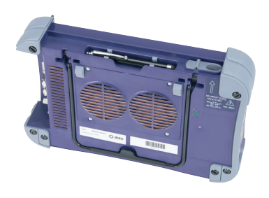
E6200 MSAM and Fiber module carrier