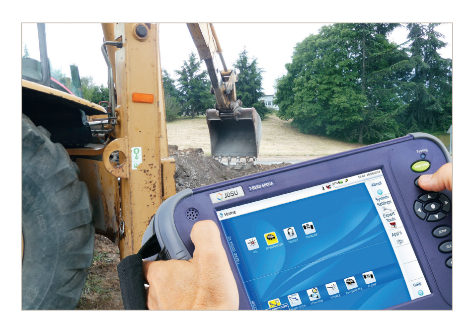
Portable and upgradeable platform with interchangeable test modules increases technician productivity

The flexibility of interchangeable module carriers and various plug-in modules let users create a platform that meets today's specific testing needs and yet it can evolve seamlessly to meet tomorrow's ever-changing network requirements.